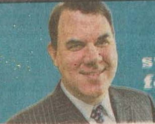
Alan Grayson supports halt on foreclosures, B3